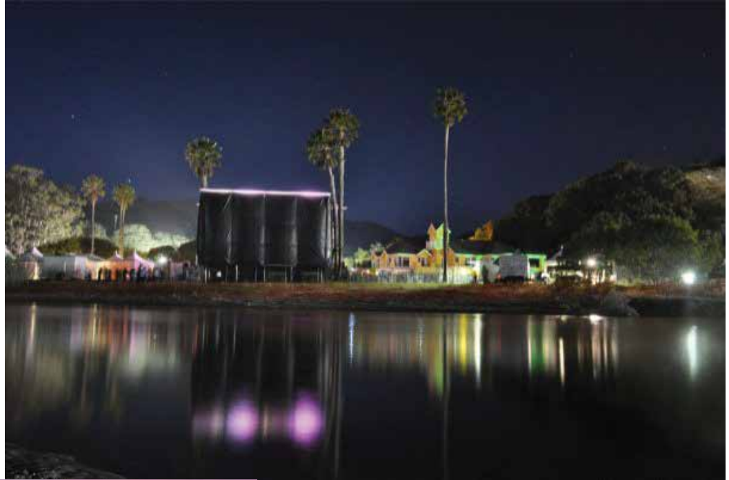
Avila Beach Resort at night