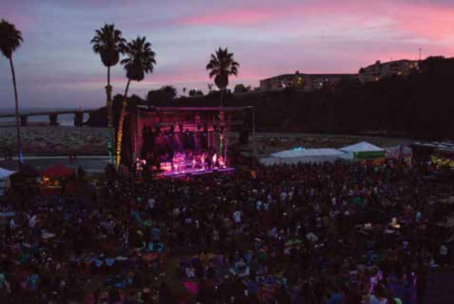
Avila Beach Resort Concert at Sunset