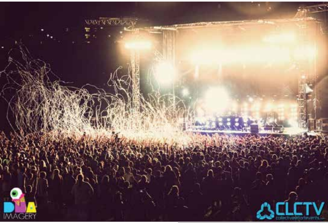
Avila Beach Resort Evening Concert