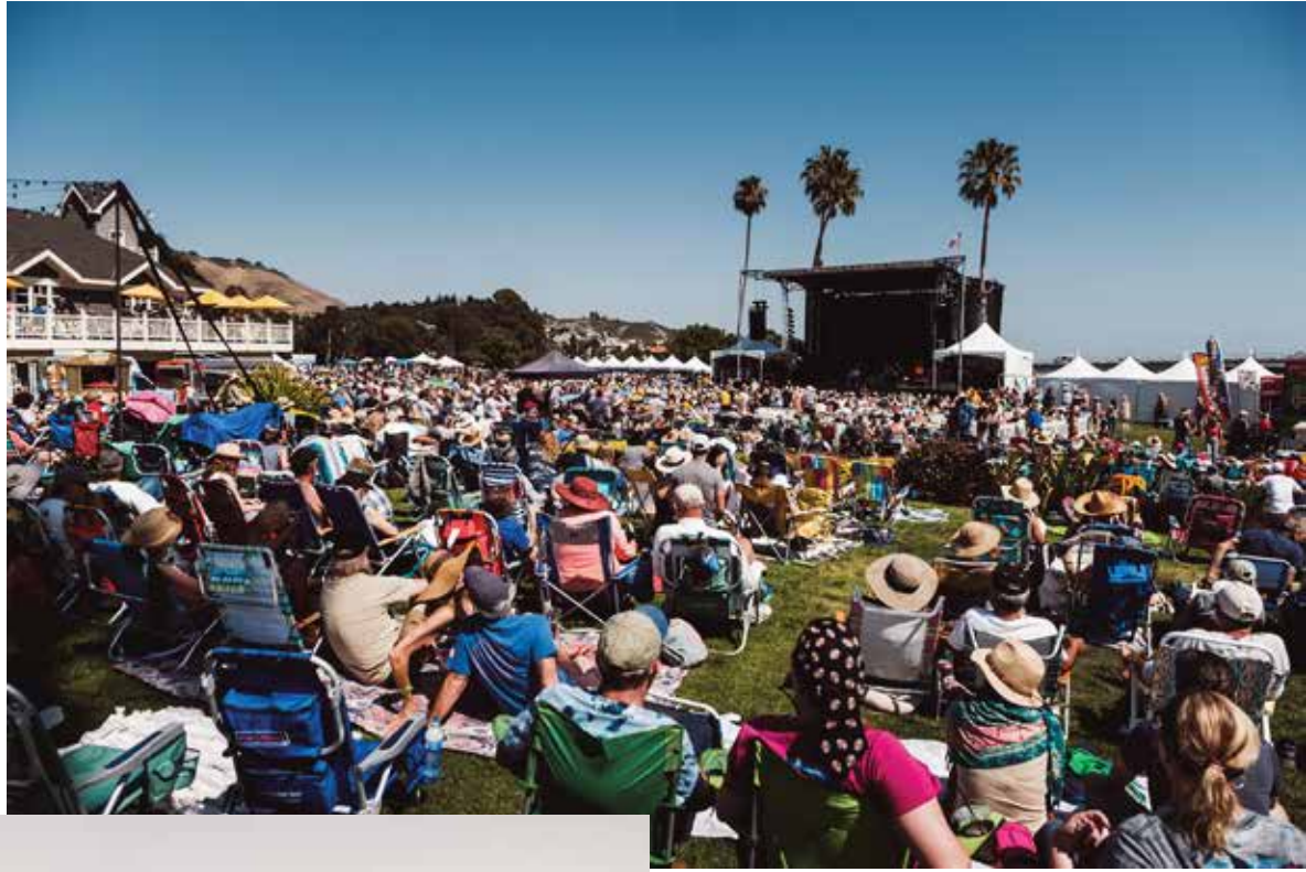
Avila Beach Resort Concert