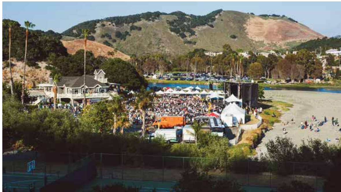
Avila Beach Resort During the Day