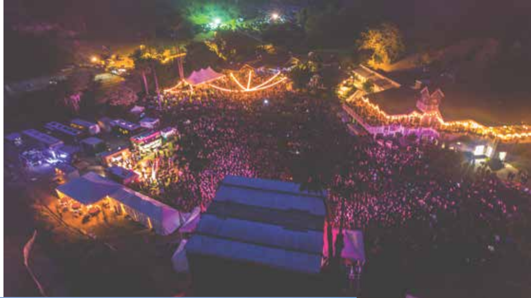
Avila Beach Resort EDM Festival